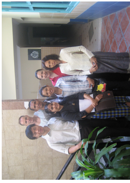
The Cambodian Tooth Angel Team

The Cambodia Tooth Angel Project aims to bring desperately needed basic dental and medical treatment to the most vulnerable and destitute people in Cambodia. These include orphans, children and adolescents living on the streets, people with HIV, and prisoners.